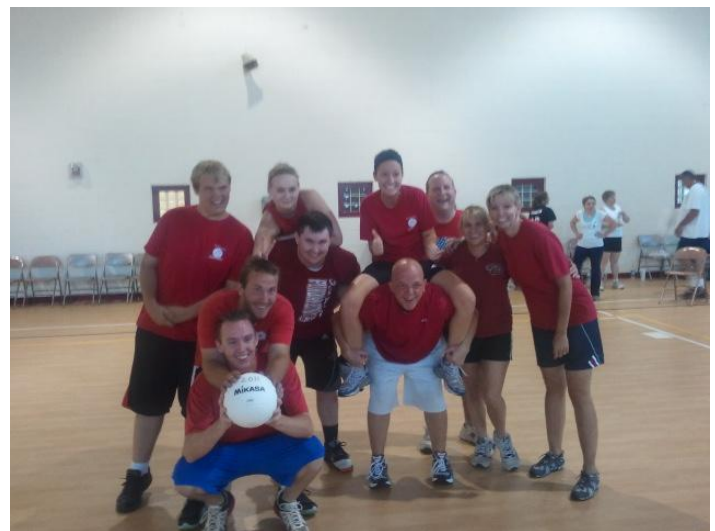
Pictured above are the young adult volleyball champions from RMUMC! CONGRATULATIONS!